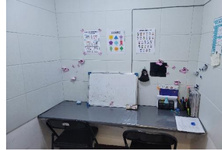
1:1 CLASS ROOM