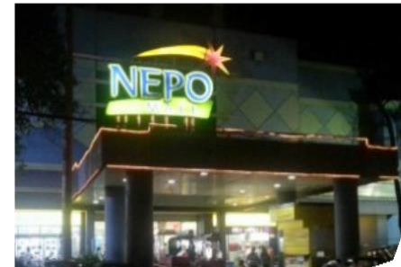
SHOPPING MALL (NEPO )