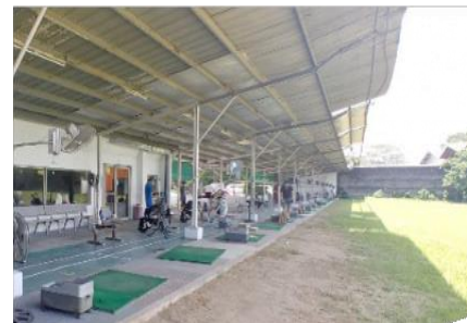
GOLF DRIVING RANGE