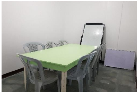
GROUP CLASS ROOM