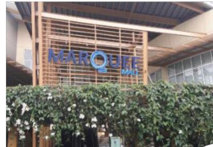
SHOPPING MALL (MARQUEE )