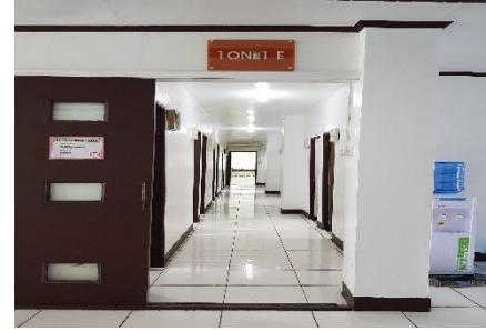
1:1 CLASS ROOM HALLWAY