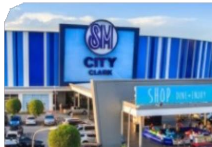
SHOPPING MALL (SM)