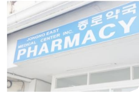
HOSPITAL AND PHARMACY