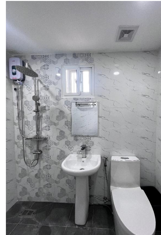
ROOM FOR 2,3 PEOPLE